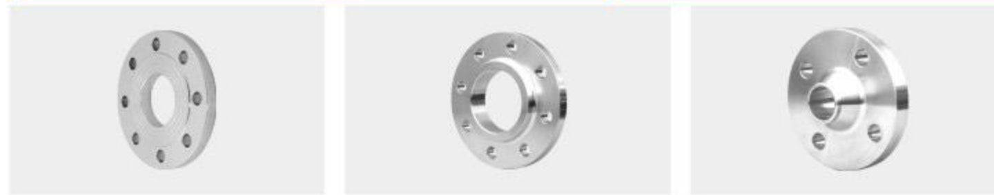
平焊法兰 Flat welding flange 带颈平焊法兰 Flat welding flange with neck 带颈对焊法兰 Butt welding flange with neck