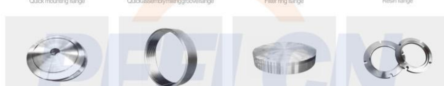
非标圆盘 Non-standard disc 非标锻件法兰 Non-standard forging flange 管板 Tube sheet 铣槽法兰 Milling groove flange