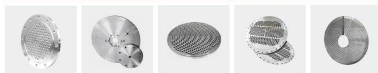
管板 Tube sheet 管板 Tube sheet 管板 Tube sheet 管板 Tube sheet 管板 Tube sheet