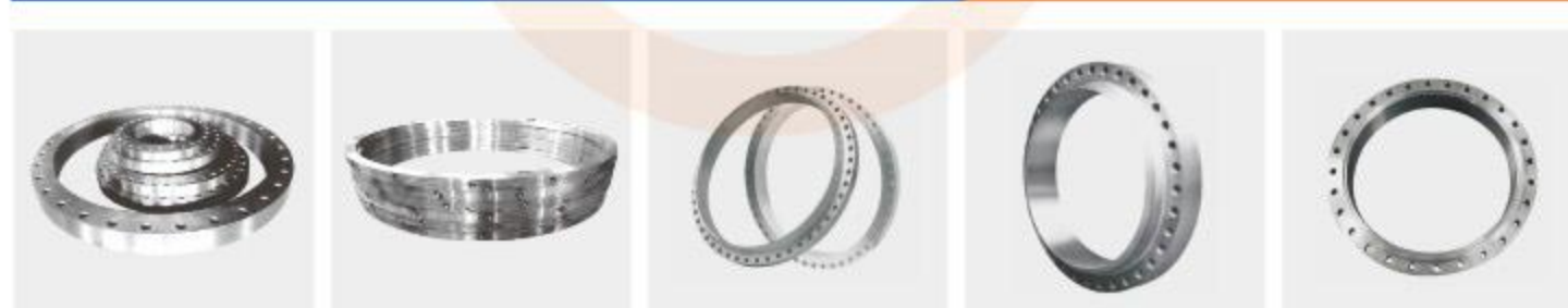
大口径法兰 Large diameter flange 大口径法兰 Large diameter flange 大口径法兰 Large diameter flange 大口径法兰 Large diameter flange 大口径法兰 Large diameter flange