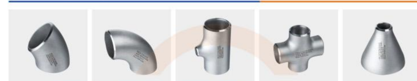
45°弯头 45° elbow 90°弯头 90° elbow 三通 Tee 四通 Stone 大小头 Size head