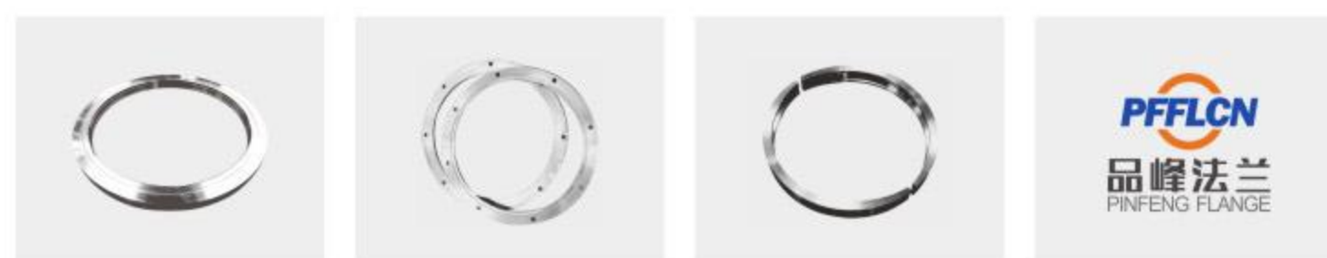
乳化设备法兰 Emulsification equipment flange 水处理法兰 Water treatment flange 卡箍法兰 Clamp flange