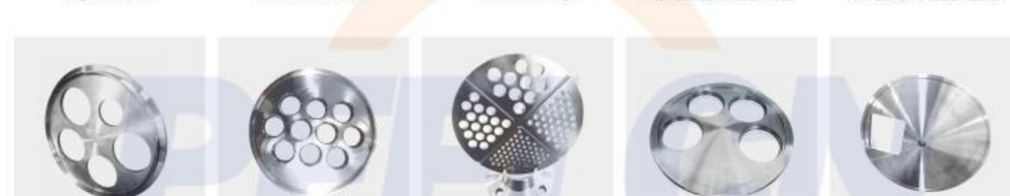
过滤器滤芯法兰 Filter element flange 冷凝器管板 Condenser tube sheet 冷凝器孔板 Condenser orifice 滤袋法兰 Filter bag flange 非标盲板 Non-standard blind