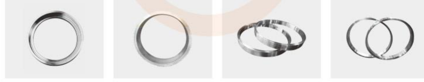
沟槽法兰 Groove flange 滚齿法兰 Hobbing flange 过滤器法兰 Filter flange 人孔套圈法兰 Manhole ferrule flange