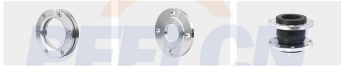
视镜 glass 内螺纹法兰 Internal thread flange 橡胶软接头法兰 Rubber soft joint flange