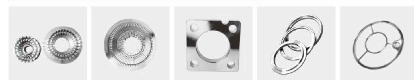
转子泵 Rotor pump 转子泵法兰 Rotor pump flange 方型法兰 Square flange 过滤器三件套法兰 Three-piece filter flange 异形法兰 Special-shaped flange