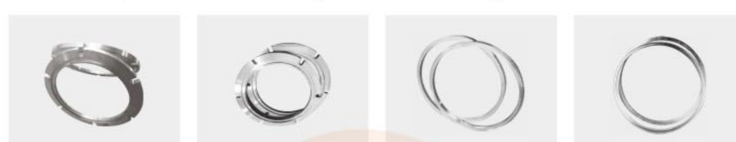
快装法兰 Quick mounting flange 快装铣槽法兰 Quick assembly milling groove flange 过滤器套圈法兰 Filter ring flange 树脂法兰 Resin flange