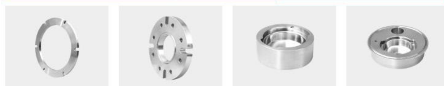
非标法兰 Non-standard flange 非标法兰 Non-standard flange 226芯法兰 226 core flange 226芯底座 226 core base