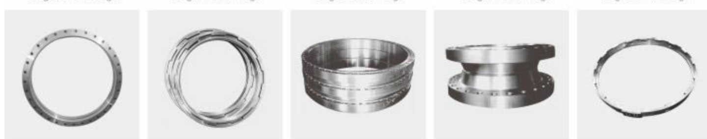
大口径平焊法兰 Large diameter flat welding flange 杀菌锅法兰 Sterilization pot flange 压力大口径容器法兰 Pressure large diameter container flange 高压对焊法兰 High pressure butt welding flange 提取罐出渣门锁紧圈 Extraction tank slag door locking ring